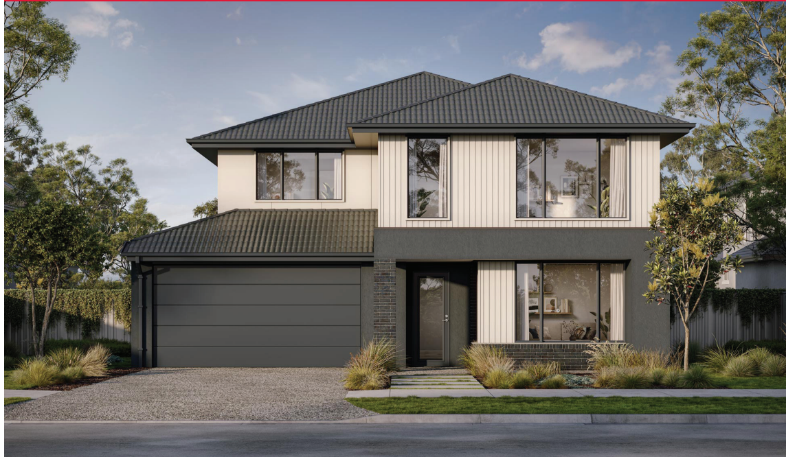
GISBORNE 34 | ELEVATE RANGE