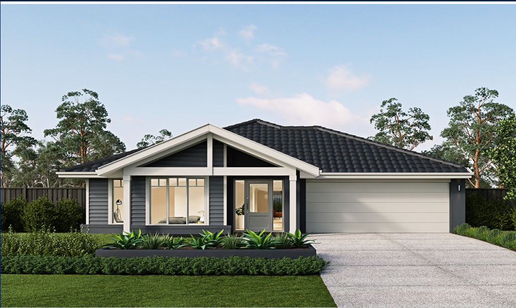
Price excludes upgrade items above standard specification such as feature render and bricks, front entrance timber decking, front entry door, brick infills above garage, external lighting, fencing, concrete paths and driveway. Façade Image may also contain items not supplied by Metricon Homes, namely landscaping and planter boxes.